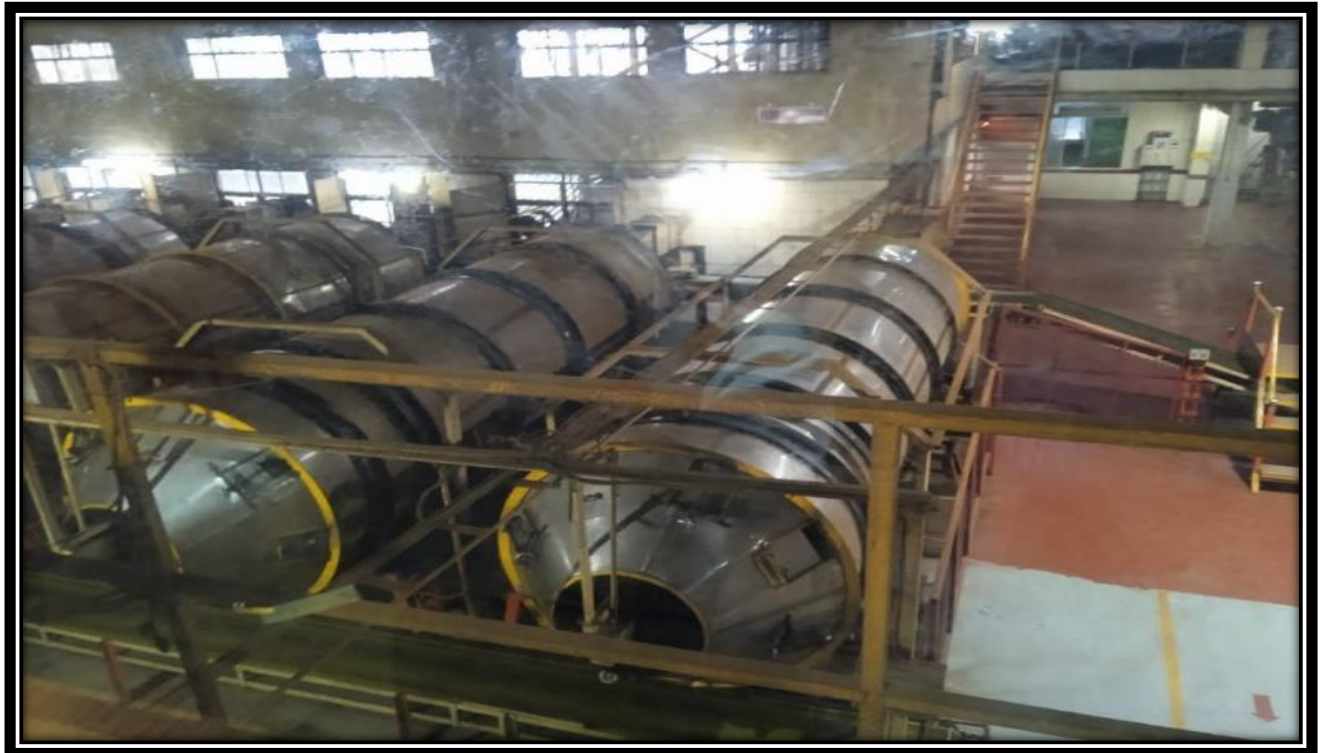
Kanan Devan Hills Plantation Company (Ripple Tea Factory)