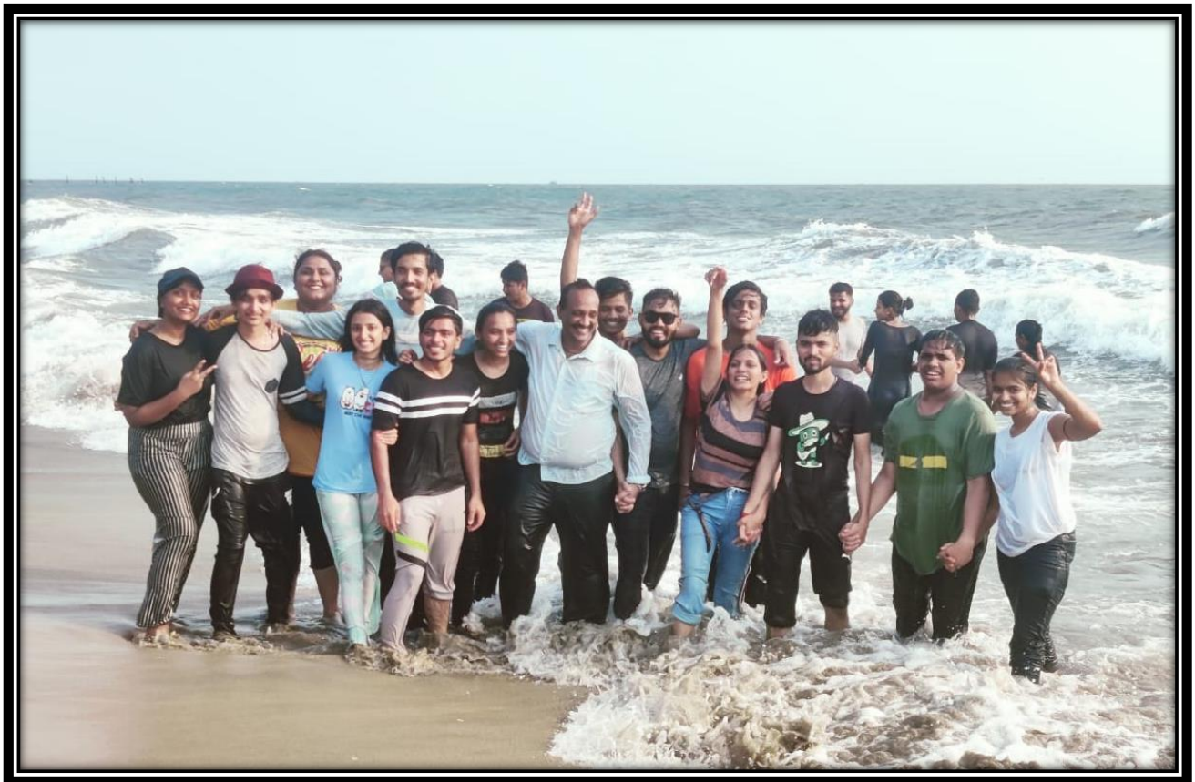
Kozikode Beach Adventure Sports