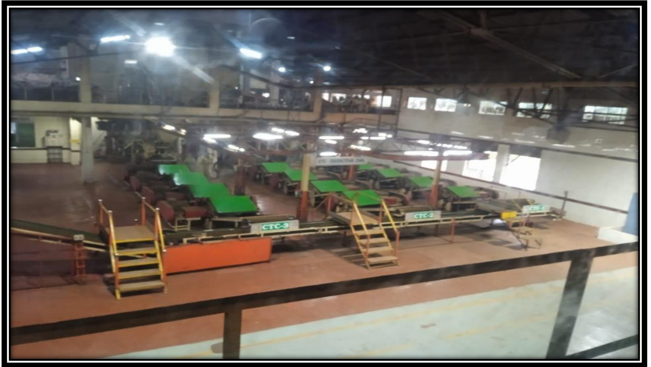
Ripple Tea Manufacturing Plant