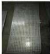
Project image 2.jpeg 115K

Gmail - Start-up ~ VISA TECH INDUSTRIES LLP