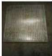
Project image 1.jpeg 145K